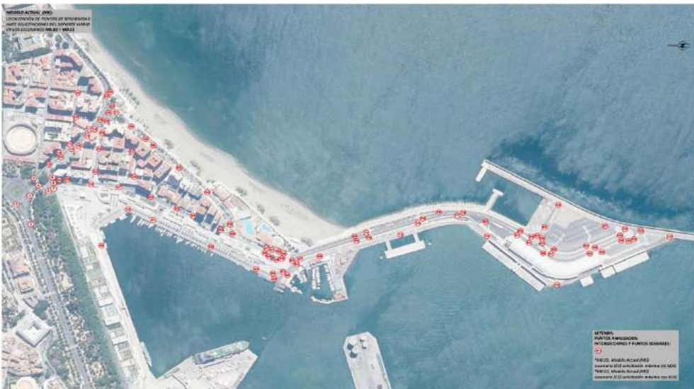
Figure 3: Model control points.

In the simulation of the new demand generated in relation to the city traffic, two scenarios are considered, the morning rush hour at 8:00 a.m. and the afternoon at 2:00 p.m.