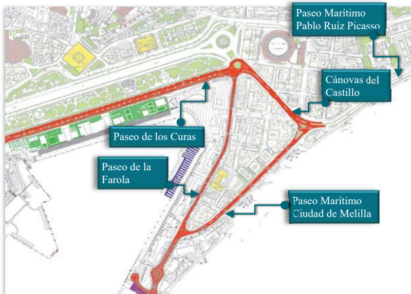
Figure 2: Study area: main city roads affected.

The need to verify the functionality and response of the road system after the new activities of the Port, as well as their effects, should be understood as they would be integrated in the city. Each new use and activity will affect the mobility directly at local and city levels.